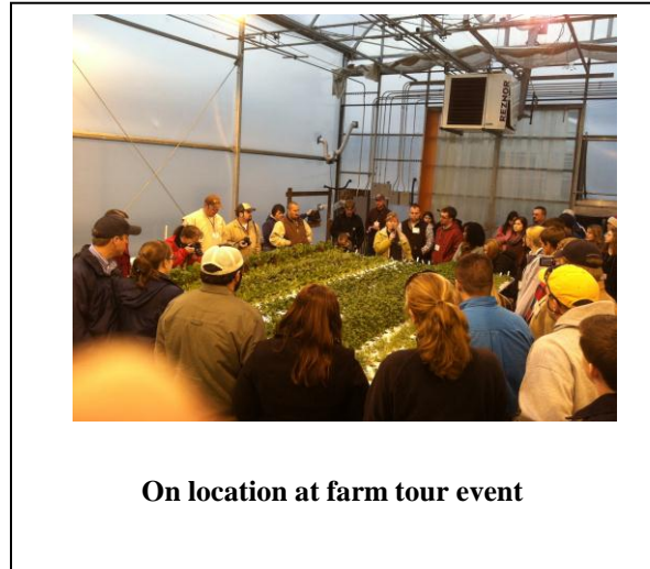
On location at farm tour event

-VALOR program planning focus group participant