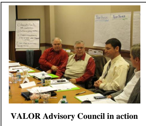
VALOR Advisory Council in action